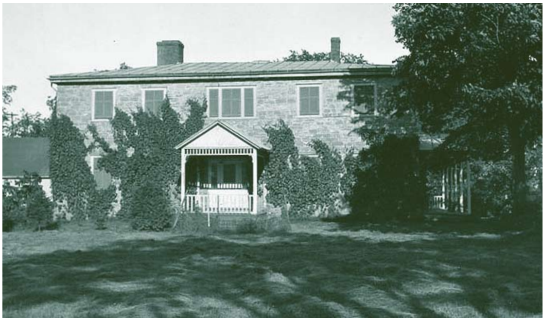
Macdonell/Williamson House