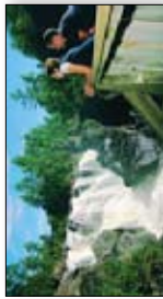
Title: Grand Chute.