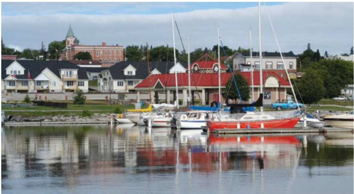
Haileybury Waterfront

All waterway visitors will be encouraged to respect other users as well as the river. They will be expected to assume responsibility for their actions on the river and to exercise care of the river that befits its designation as a Canadian Heritage River.