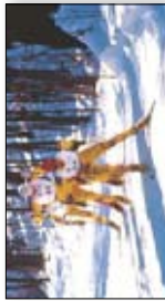
Title: Lopper.