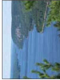
Title: Deep Waters