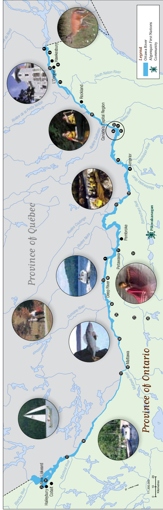
Map 5: Ottawa River – Communities and Recreational Values