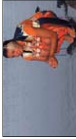
Title: First Nations.