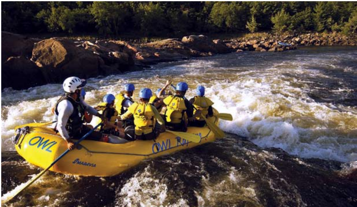
World Class Paddling

The Ottawa River is recognized as one of the best white-water destinations in the world. In 2007, the World Freestyle Kayak Championships returned to the Rocher Fendu section of the Ottawa River. The combination of warm water and high volume rapids attracts paddlers from around the world to this untamed stretch of river.