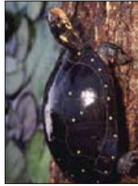
Title: Spotted Turtle