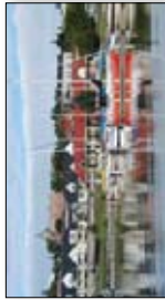
Title: Waterfront.