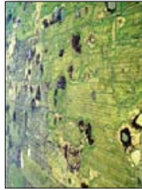
Title: Allied Bog