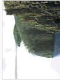
Title: Spirit Rock