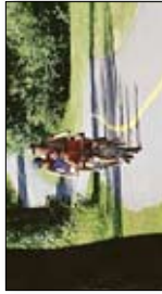
Title: Route Verte.