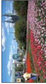
Title: Tulip Festival.