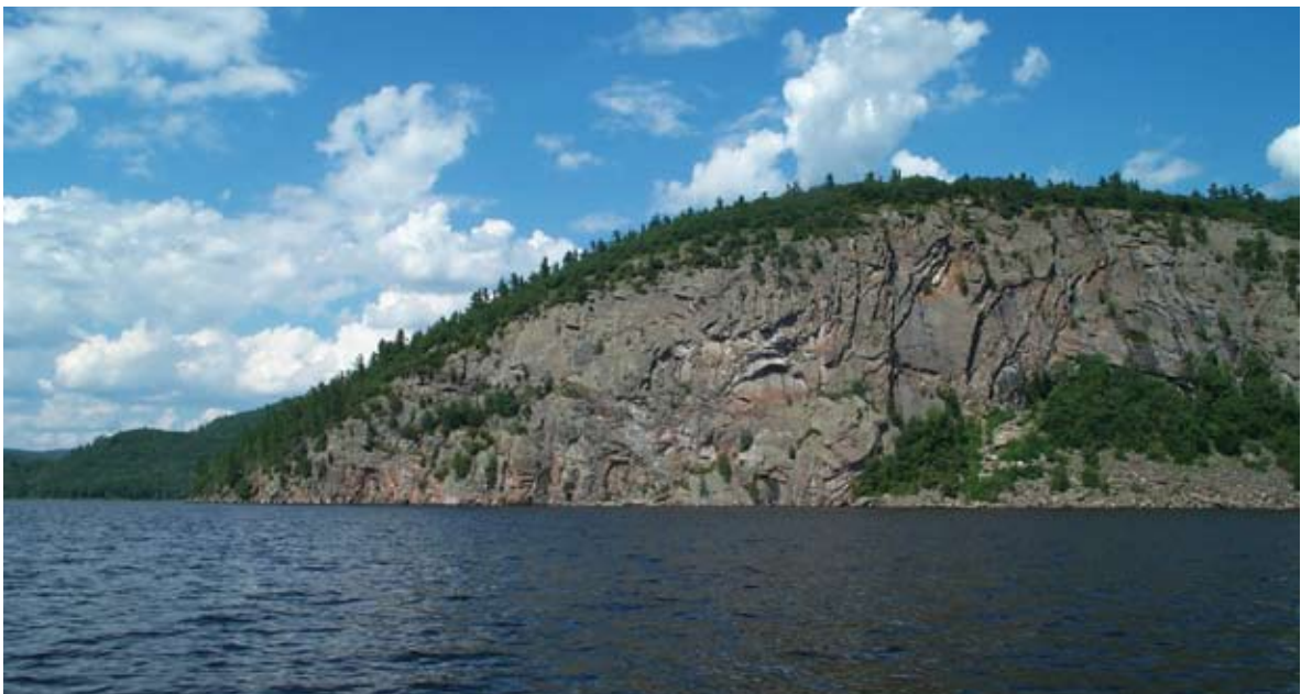
Oiseau Rock

Strong river currents have created underwater caves near Westmeath Provincial Park. A mapped network of over four kilometres of twisting passages represents a unique geologic formation in Canada.