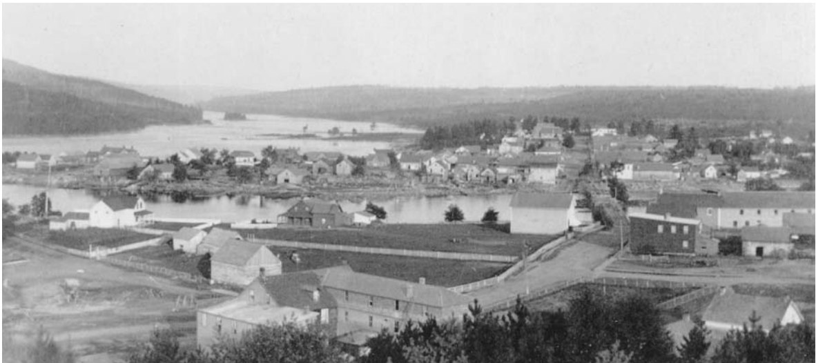
Explorers Point, Mattawa, Confluence of two Heritage Rivers

CHRS status will reflect the desire by all parties to ensure that land use planning and resource development properly account for, and conserve, the integrity of the cultural, natural and recreational values for which the river has been nominated. The strategic challenge lies in fostering cooperation and sharing of common goals among all parties associated with the Ottawa River. The Ottawa River will be effectively managed as a Canadian Heritage River as all partners integrate the protection of the values of the river into their activities and plans.