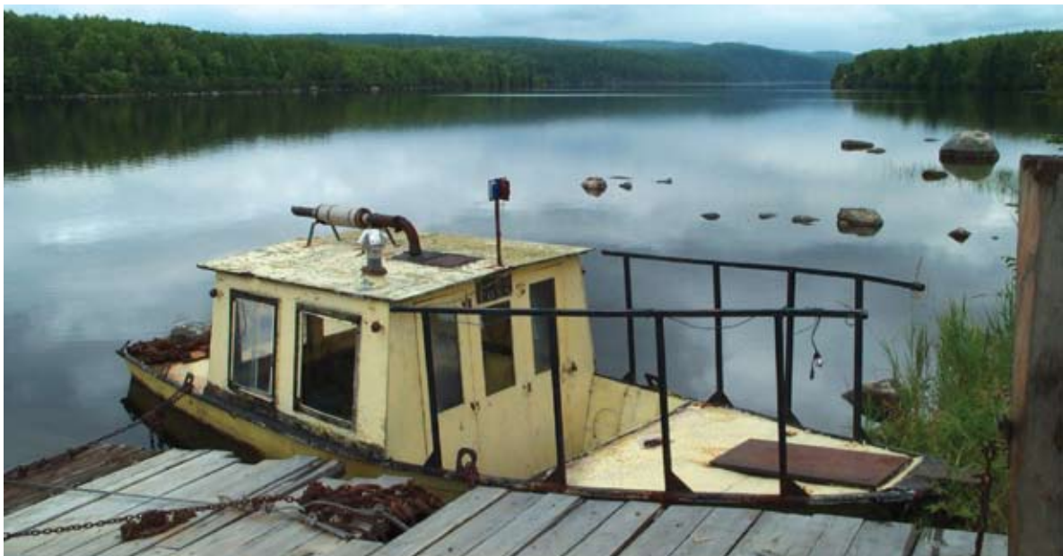
At days end on the Ottawa River

Between Lake Timiskaming and Deep River, there is very little shoreline development. The next stretch including the Town of Deep River, the Town of Petawawa and the City of Pembroke, including Moore's Beach downstream of Pembroke, represent significant urban development.