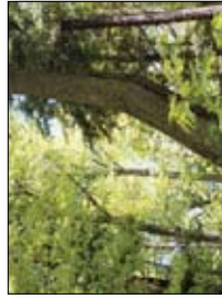
Title: Gillies Grove