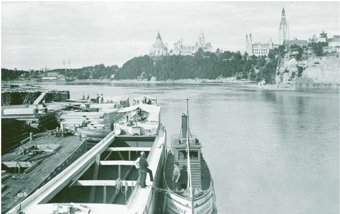
Parliament Hill from the Ottawa River

This heritage strategy recognizes and accommodates adjacent land and resource uses of the river, while ensuring that the cultural heritage, natural heritage and recreational values for which the river was nominated for are recognized, conserved and celebrated. The heritage strategy and designation of the Ottawa River as a Canadian heritage river does not impose new legislation or new regulations for use of the river and adjacent lands, nor does it change jurisdictional responsibilities for river management.