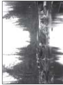
Title: Source Waters